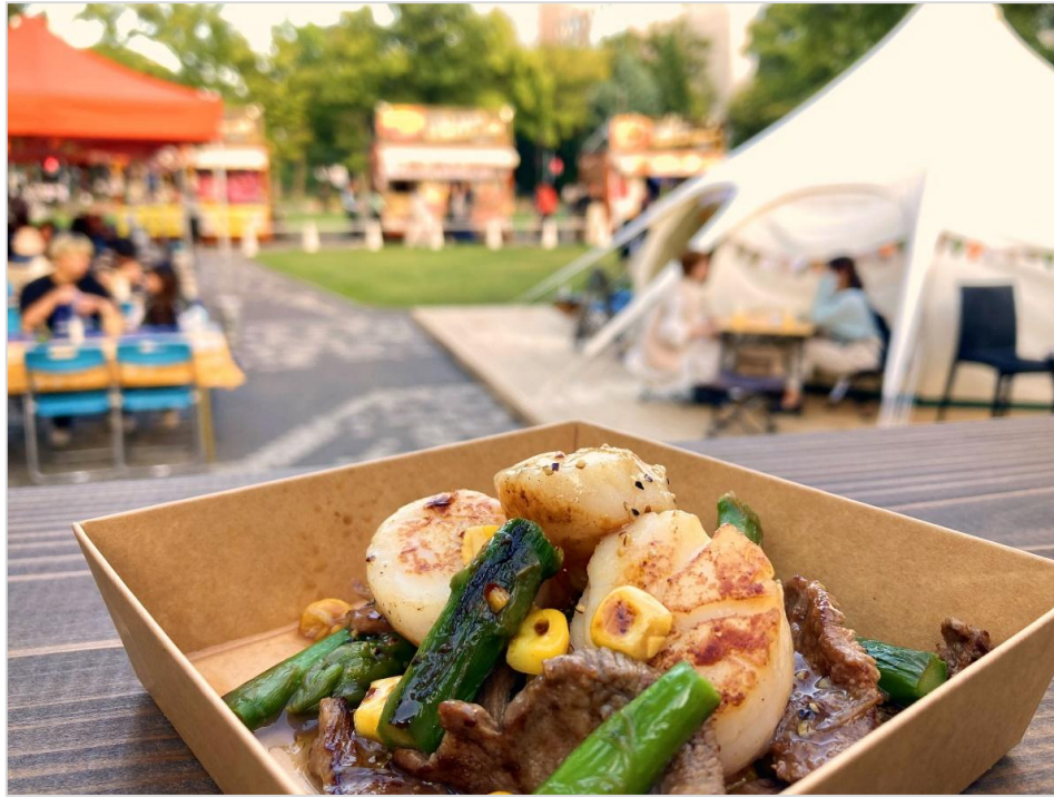
Odori Park 10-chome