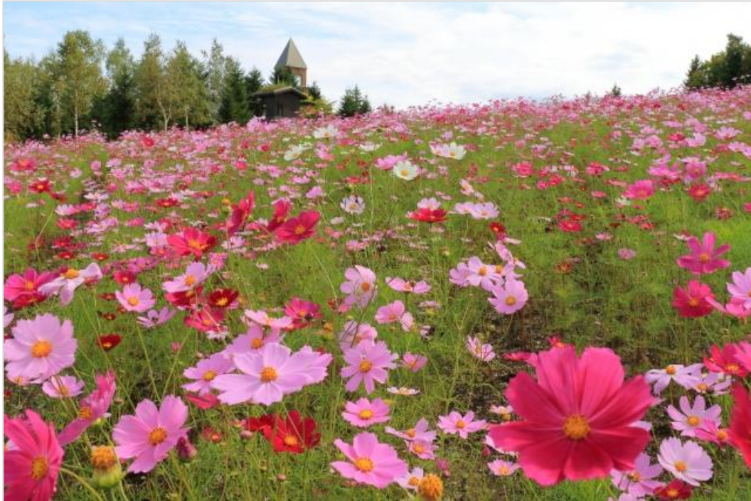
Cosmos in Takino Suzuran Hillside Park