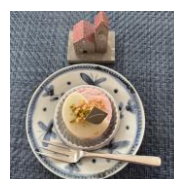
Nanseki Cake (soft stone cake)