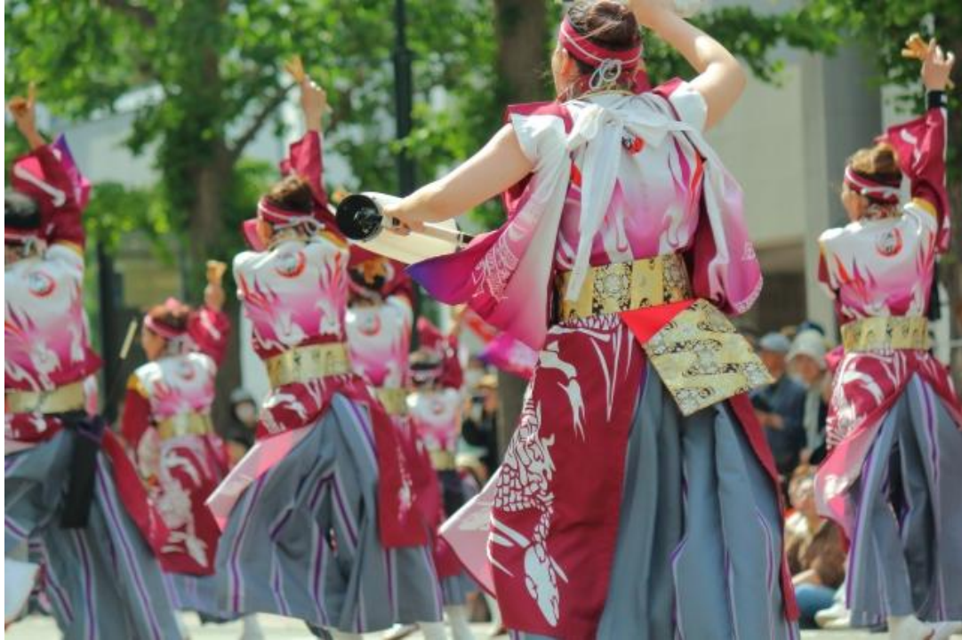
Yosakoi Soran Festival