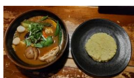
Vegetable Soup Curry ¥1,380